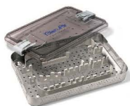
1600477-001 Sterilization tray