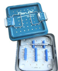
1600669-001 OSSEOSTAP Sterilization tray