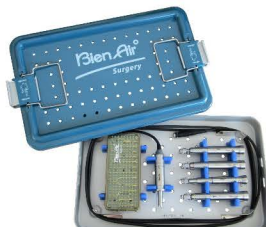
REF 1700441-001 Set Rhinoplasty sterilization tray