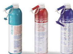
1600617-006 Aquacare 1600036-006 Spraynet 1600064-006 Lubrifluid