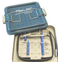
REF 1600828-001 Sterilization tray S80-S120